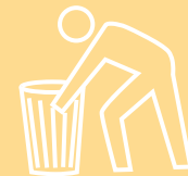
Workers handling trash