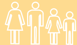
You and your family