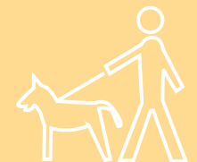
Pets, livestock and wildlife