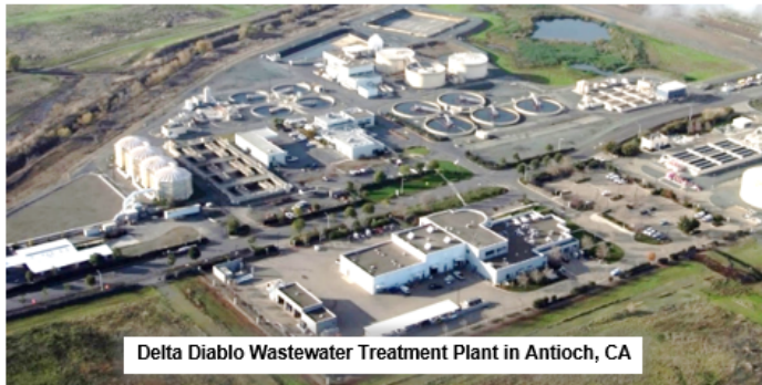
Delta Diablo Wastewater Treatment Plant in Antioch, CA

Written protests may be sent to the District (attention of "Office Manager/Secretary to the Board", 2500 Pittsburg-Antioch Highway, Antioch, California, 94509) prior to the close of the public hearing and must include your property address and the Assessor Parcel Number found on your mailing label. At the close of the public hearing, the Secretary to the Board will announce the total number of protest responses, including any received by the close of the public hearing. If written protests are presented by a majority of the parcel owners in the District's service area, the District cannot implement the SSC increases.